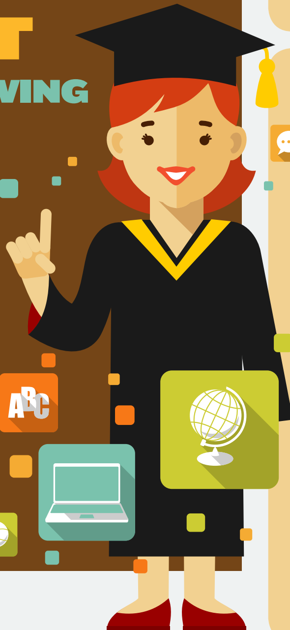
GROWTH IN ENROLLMENT AMONG FULL-TIME FEMALE STUDENTS

T he number of women enrolling in engineering has increased over time, along with their share of overall enrollment. The number of female students pursuing engineering bachelor's degrees grew by 77 percent over the past decade (2005 to 2014), and by 11 percent in master's programs and 37 percent in doctoral programs over the same period. However, due to increasing enrollment among men, the share of women in engineering bachelor's degree programs grew by a modest 4 percentage points between 2005 and 2014, and remained unchanged in master's and doctoral programs. Consequently, as of 2014, women constituted about 21 percent of bachelor's, 23 percent of master's, and 25 percent of doctoral students in engineering.